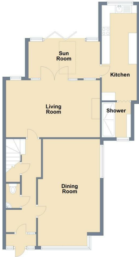
Ground Floor Approx. 84.0 sq. metres (904.0 sq. feet)